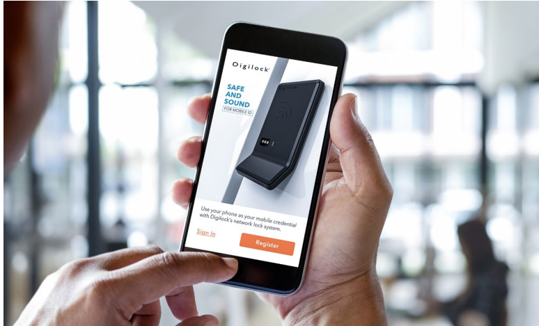
End User Smart Phone APP